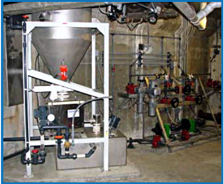
SVENMIX DTM with SVENCHEM DUPLEX PUMP SKID

Examples; Soda Ash, Potassium Permanganate, Hydrated Lime, Magnesium Hydroxide, and Phosphate Compounds. The system is fully automated and self-contained. The SVENMIX DTM can be designed so that chemicals can be delivered in bags, bulk bags or in bulk.