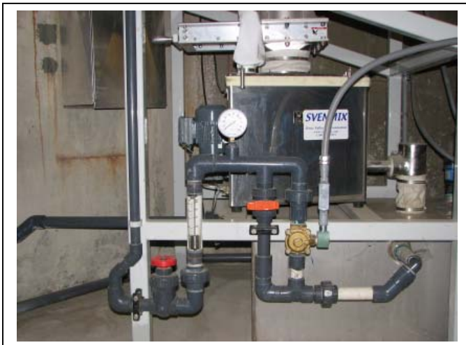
SVENMIX DTM Volumetric Feeder, Dissolving Tank and Mixing Water Controls

Ease of calibration and simplified controls insure a standard solution with every batch. A level controller in the Dissolving Tank initiates the dry chemical feed from the Volumetric Feeder and opens the Mixing Water Solenoid Valve. When the Dissolving Tank is full the Level Controller shuts the system down until more solution or slurry is called for.