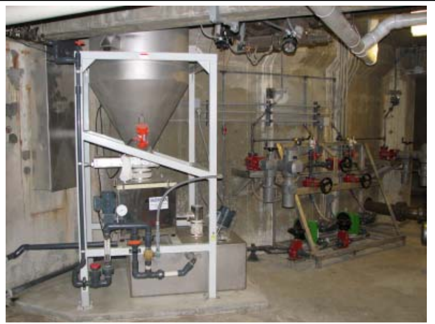
SVENMIX DTM with SVENCHEM DUPLEX PUMP SKID

As examples; Soda Ash, Potassium Permanganate, Hydrated Lime, Magnesium Hydroxide, Phosphate Compounds. The system is fully automated and self-contained. The SVENMIX DTM can be designed so that chemicals can be delivered in bags, bulk bags or in bulk