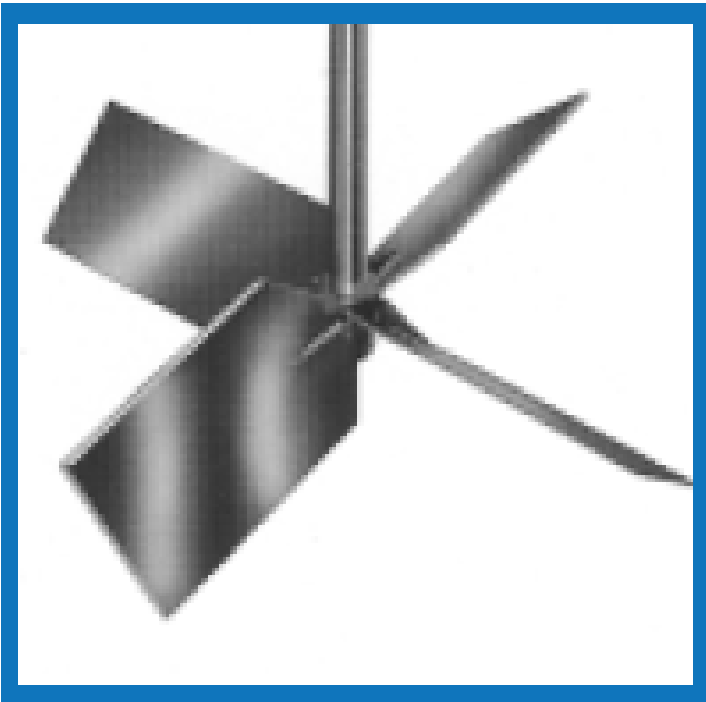
SVENMIX 4 BLADE TURBINE

Larger sizes are available on request. Hastelloy propellers are available and Teflon coating is available for most propellers and turbines.