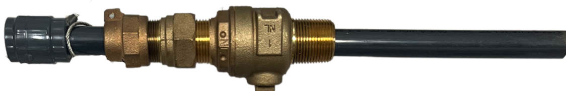
1.5" Corp Stop with a 1" PVC Nozzle w/1" FPT Connection.

SVEN manufactures SVENINJECT Chemical Injection Valves for all applications. SVENINJECT Valves insure that the chemical is injected directly into the middle of the flow for rapid dispersion.