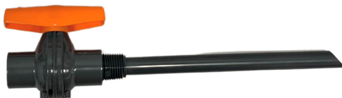
1/2" Ball Valve with a 1/4" Nozzle.